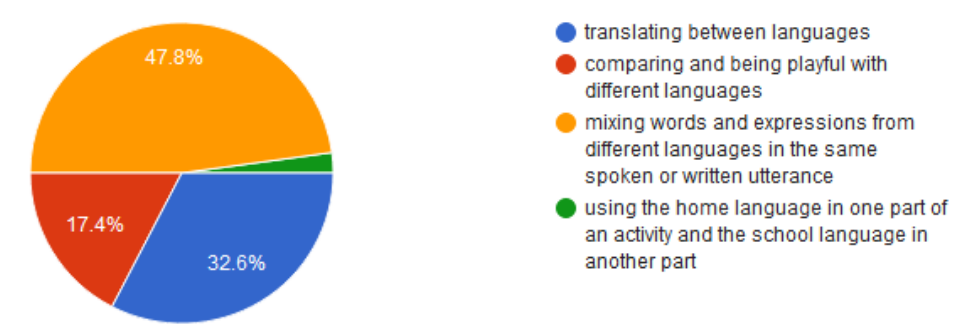
Figure 2: TL strategy most frequently used by the students

Finally, regarding the strategy of TL they used, the students' responses can be seen in Figure 2.